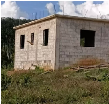
Deacon Simpson's New Home Under Construction