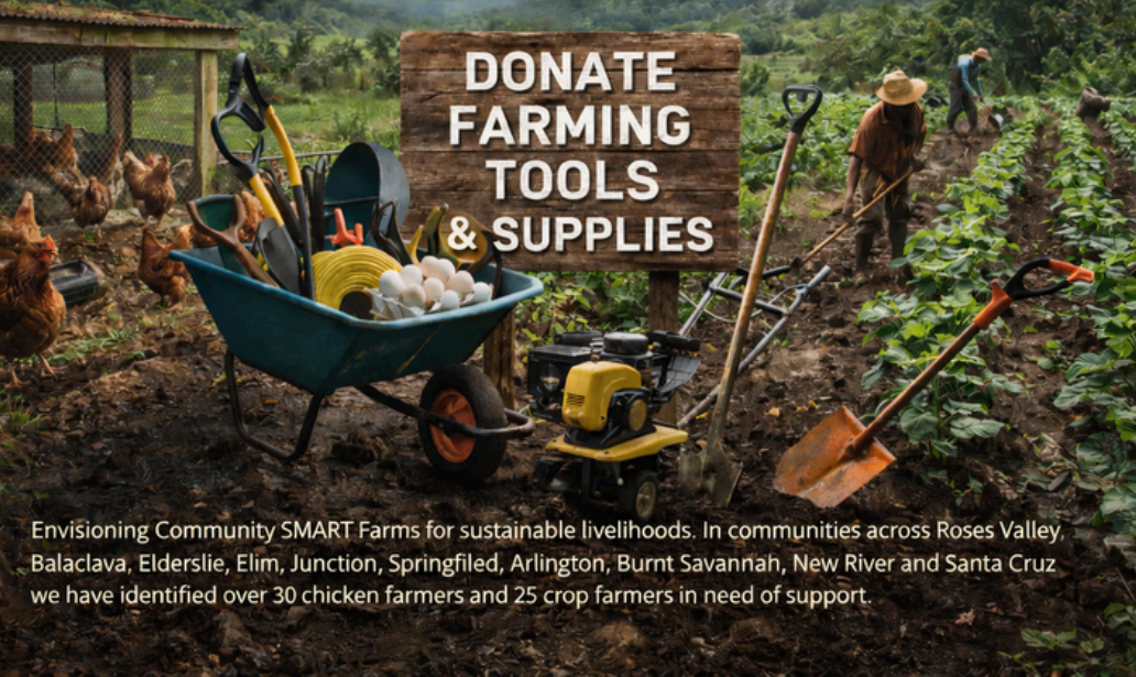
Envisioning Community SMART Farms for sustainable livelihoods. In communities across Roses Valley, Balaclava, Elderslie, Elim, Junction, Springfield, Arlington, Burnt Savannah, New River and Santa Cruz we have identified over 30 chicken farmers and 25 crop farmers in need of support.