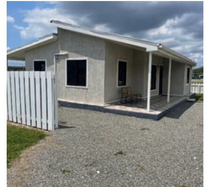
A Hardware & Lumber Home

Hurricane Melissa severely impacted his family. After losing part of their roof and facing eviction from their rented home, they were forced to leave. Though construction on a new house has begun, it is not yet habitable.